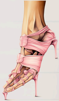
NEW SUPER COOL PROSTHETIC FOOT