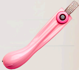
VERY COOL DILDO