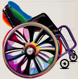
VERY AWESOME NEW WHEELS